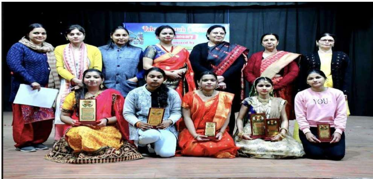
Winners of Talent Search Competition with Principal and Faculty members

Talent Search Competition was organized on 31 st January 2023. Singing and Dancing competition were organized for fresher students of the college.