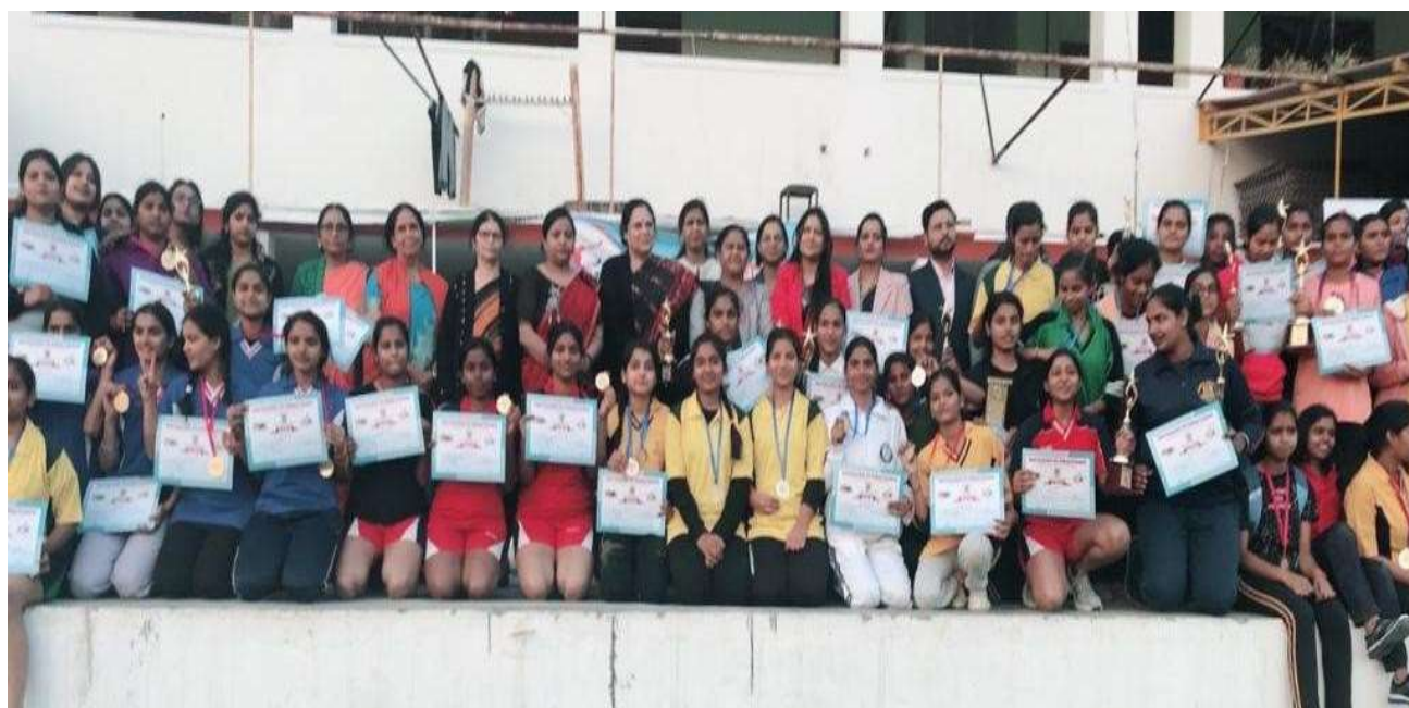
Participants of Annual Sports Competition with Principal and Faculty Members, 03 Feb 2023.