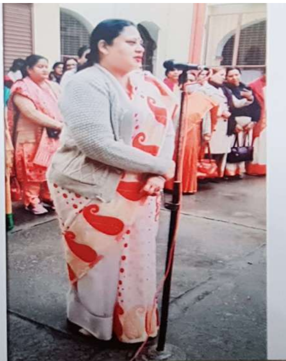
Speech by Principal