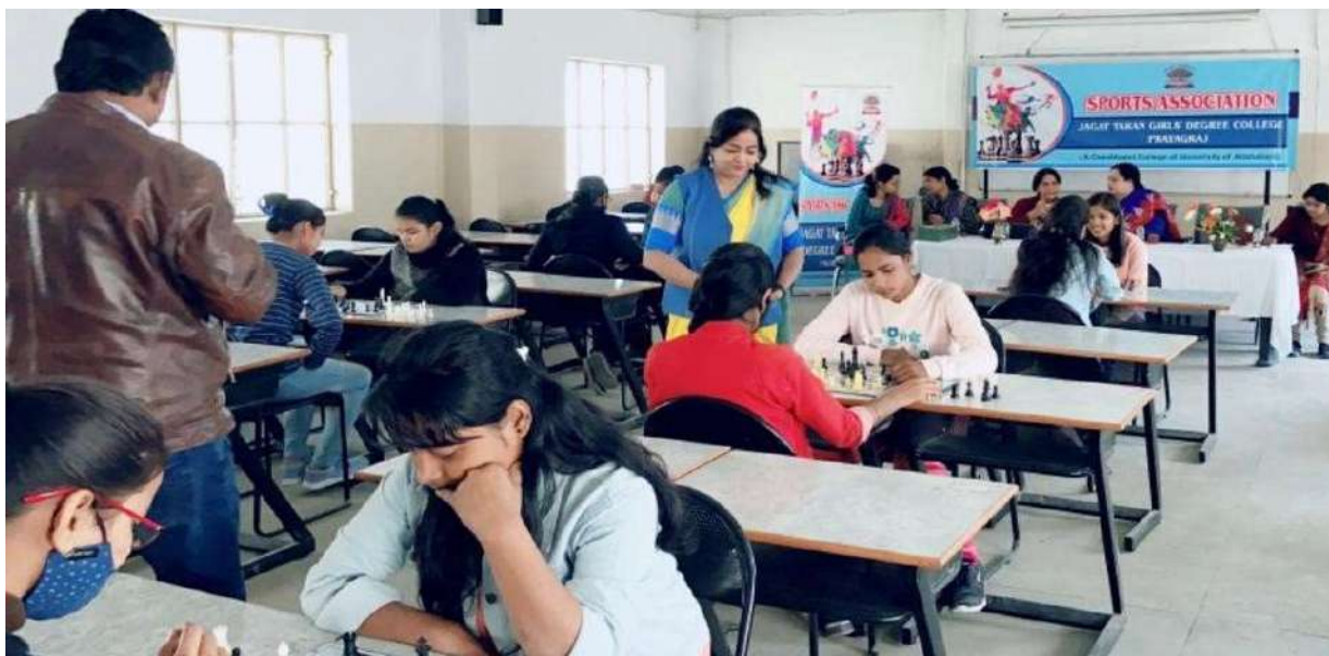
Participants of Chess Competition

Total Participants: 18 students of B.A. and B.Com.