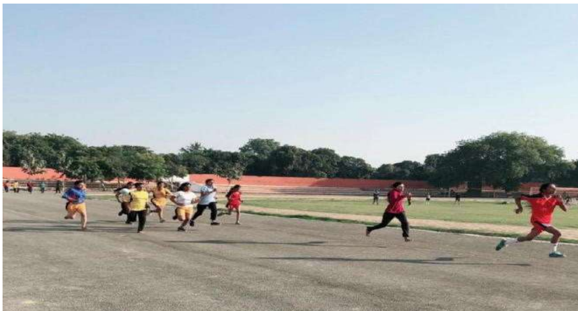
Race 100 Meter

Total Participants: 46 Students of B.A. and B.Com.