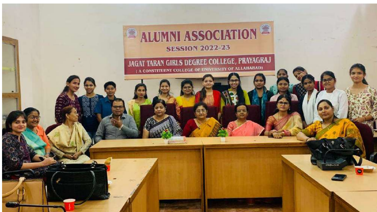
Many Alumni of College & students of college participated in annual Alumni meet