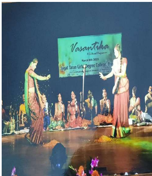
Students Perform Hori Geet