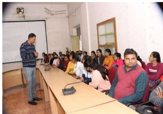
Counseling session with students of JTGDC.