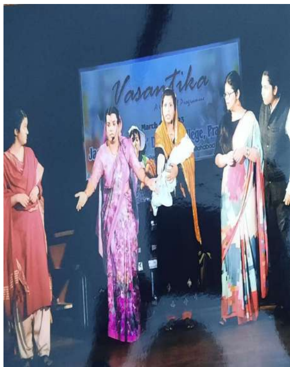
Play : Ek Shauhar ki khatir