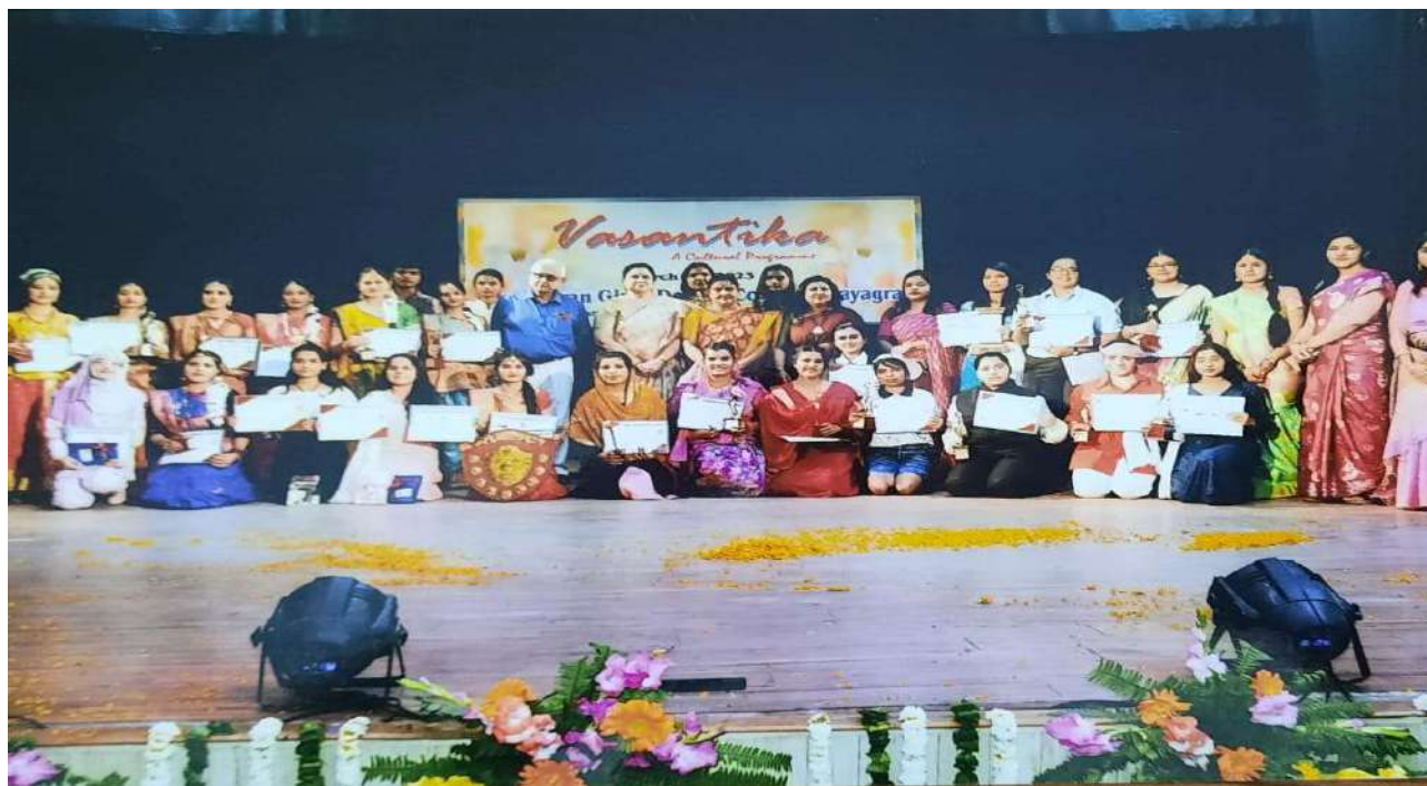
Chair Person, Principal, Faculty Members & Students on the Occasion of Annual Function 'Vasantika', 06 March 2023.